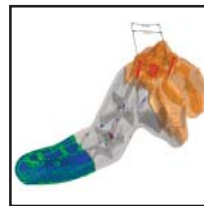
3D metrology and pore analysis of an automotive control arm