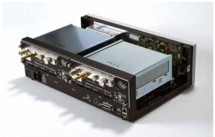
Pneumatic Control Module