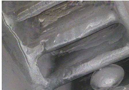
HP Nozzle Block FME