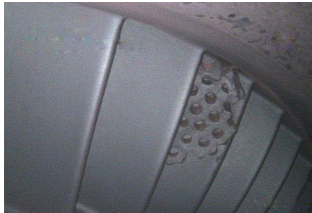
FME on Turbine Blade