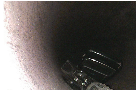
Extraction Line Retrieval-Cell Phone