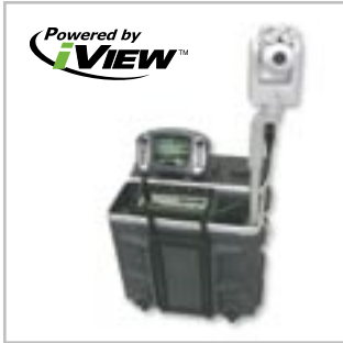
CA-ZOOM® PTZ Series High-power zoom (up to 300:1) with joystick-controlled color pan-tilt-zoom camera and color VGA display