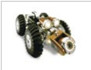
ROVER® Steerable robotic crawlers